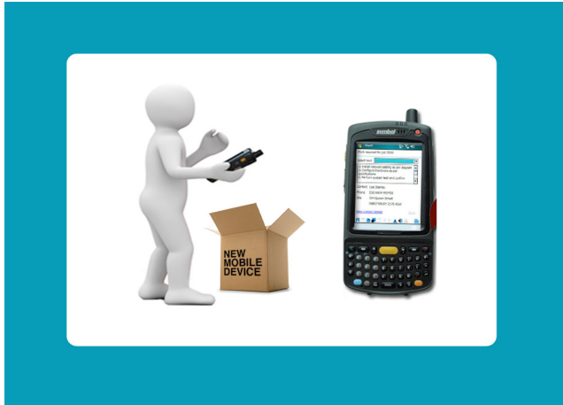
Deployment as simple as ABC

This provides the platform for your business to realise: